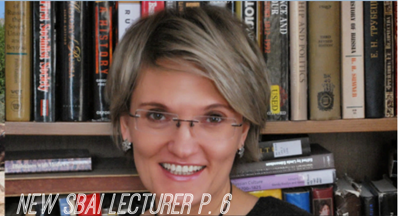
NEW SBAI LECTURER P. 6