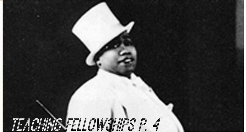
TEACHING FELLOWSHIPS P. 4