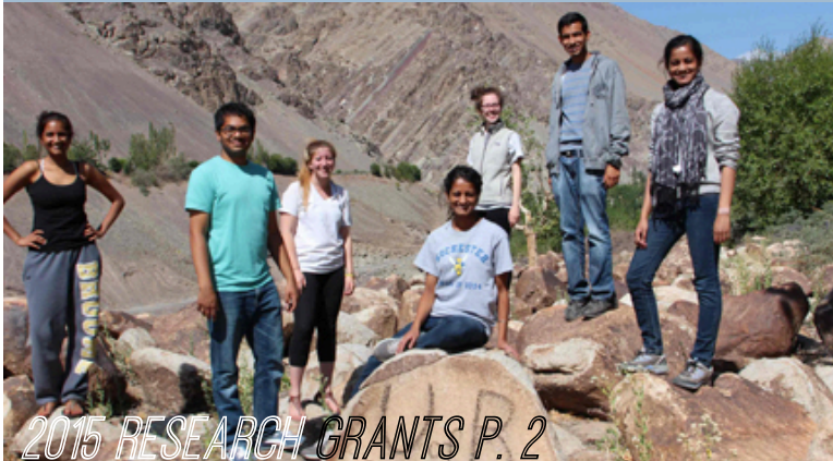
2015 RESEARCH GRANTS P. 2