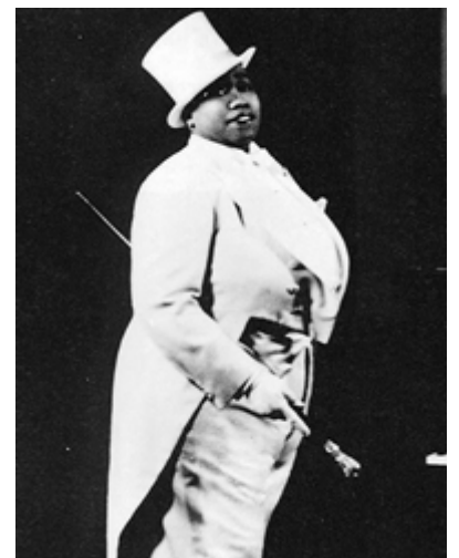
Gladys Bentley, American blues singer, early 1930s