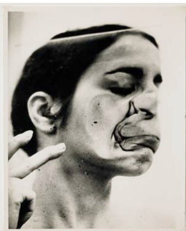
Ana Mendieta, "Untitled (Glass on Body Imprints)- Face", 1972.